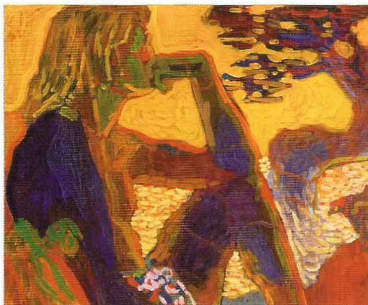
POETRY AT BIG SUR BY WILLIAM CUMMING

May 17 | The Norwegian Independence Day Parade hits the streets of Ballard. The Nordic Heritage Museum will hold an open house throughout the day with children's activities, a cafe and an exhibit on the Norwegian constitution. Details: (206) 784-9705 or ballardchamber.com .